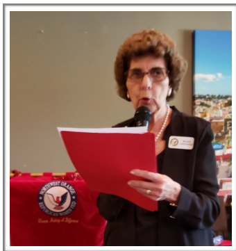
CANDID SHOTS FROM OUR "MARCH MADNESS" MEMBERSHIP MEETING